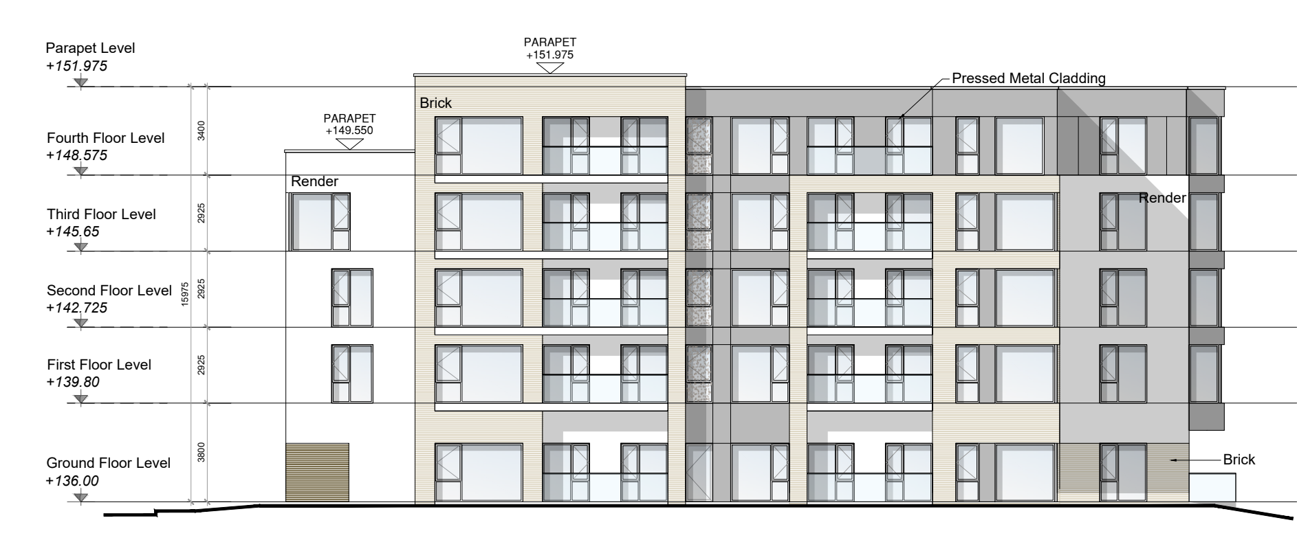
BLOCK D - NORTH WEST ELEVATION