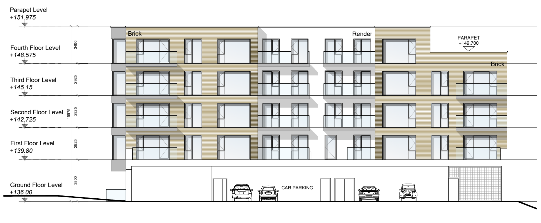
BLOCK D - SOUTH EAST ELEVATION